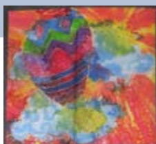
1 st Place – Hot Air Balloon