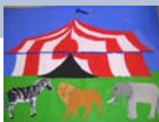
2 nd Place – Circus