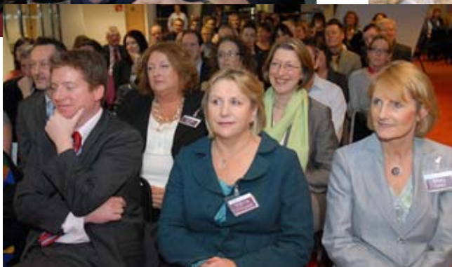
Audience at the Awards for Services to Children and Young People, Croke Park, 14 th February 2008.