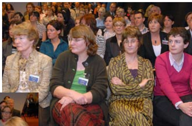
Audience at the Awards for Services to Children and Young People, Croke Park, 14 th February 2008.